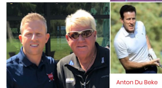
Anton Du Beke